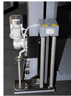
Electromagnetic film tension with easy film threading

Adjustable parameters by the control panel: cycle selection, bottom turns, top turns, rotation speed, carriage speed going up, carriage speed going down, film tension.