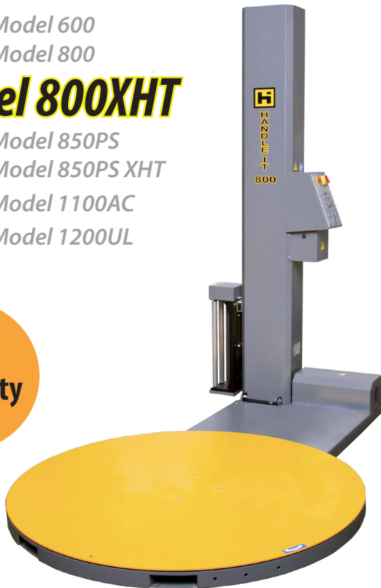
Part Number: SWM-SA-0800XHT